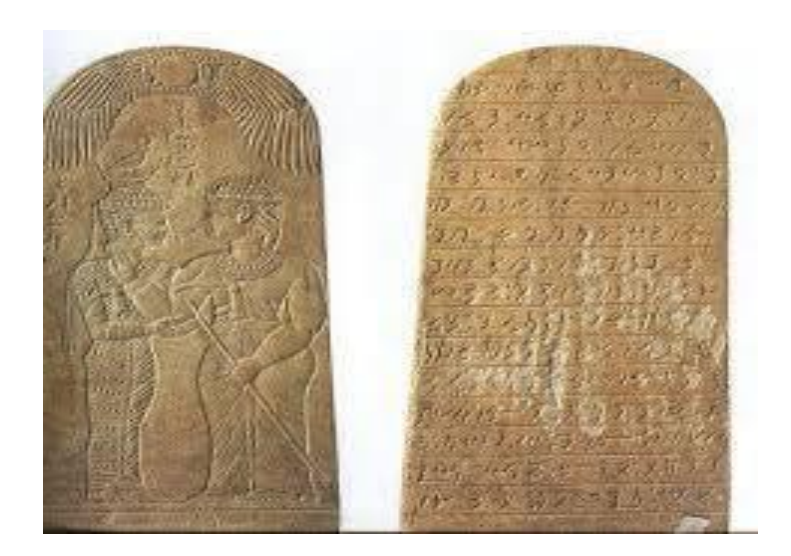
The Obelisk of king Khaliot